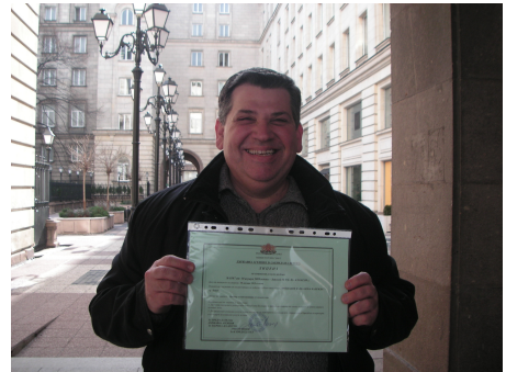
Me standing in front of the government building with our new license. Praise the Lord!

These are exciting times for us! Finally seeing four years of work coming together!